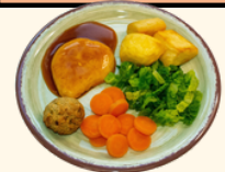
Roast Chicken Fillet Stuffing ball (G)