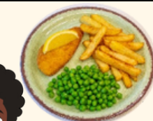
Battered Fish Fillet (F.G)