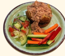
Tuna Mayonnaise (F.E)