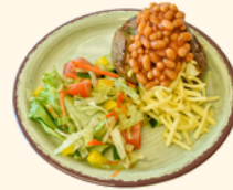
(v) Cheese/Beans (D)