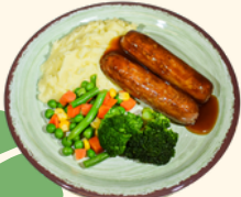
Pork Sausages (G.SU.SB.D)