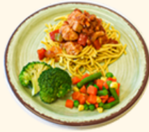
(v)(h) Chines Style Quorn (E)