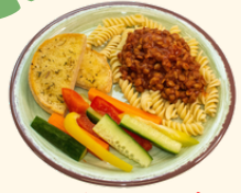
(h) Beef Bolognese (G.D)