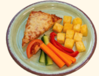
(v) Cheese & Tomato Pizza Wedge (G.D)