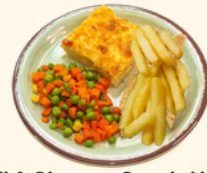
(v)(h) Cheesy Omelette (E.D)