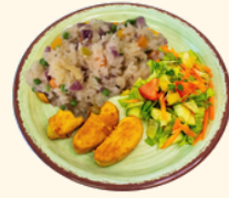
(v) Quorn Dippers (G)