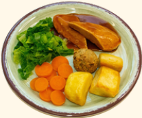
(vg) Quorn Roast Stuffing ball (G)