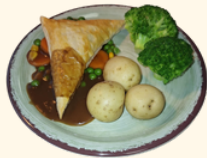
(v)(h) Vegetable Pie (G)