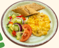
(v)(h) Mac 'n' Cheese (G.D)