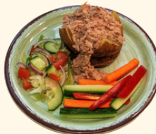
Tuna Mayonnaise (F.E)