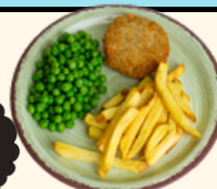
Salmon Fishcake (F.G)