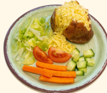
(v) Cheese (D)