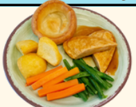
Roast Chicken Fillet Yorkshire Pudding (G.E.D)