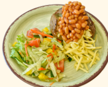
(v) Cheese/Beans (D)