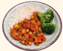
(v)(h) Vegetable Curry