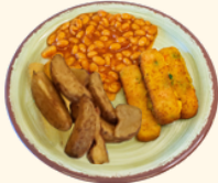
(vg) Garden Vegetable Fingers (G)