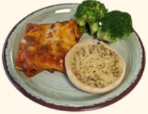
(h) Beef Lasagne (G.D)