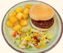
(vg) Plant Power Burger (G)